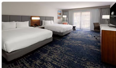
2 Queen Beds with Balcony - Comp Wifi

Conveniently located off Hwy. 99, the hotel sits on acres of gardens and features, an outdoor pool, fitness center, Café Restaurant, and the California Room.