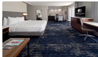
1 King Bed Junior Suite - Corner - Comp Wifi