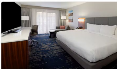
1 King Bed with Balcony - Comp Wifi